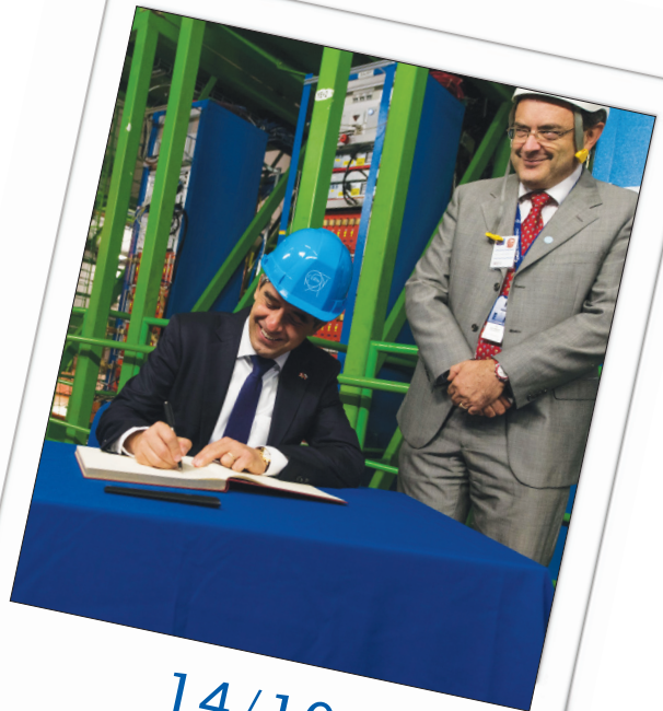
Tom Kibble – a contributor to the part of the Standard Model that gives mass to fundamental particles through interactions with the so-called Higgs boson – visited CERN. He saw the LHC experiments, CMS (here) and ATLAS, for the first time. (CMS-PHO-PUBLIC-2014-009 – 8)