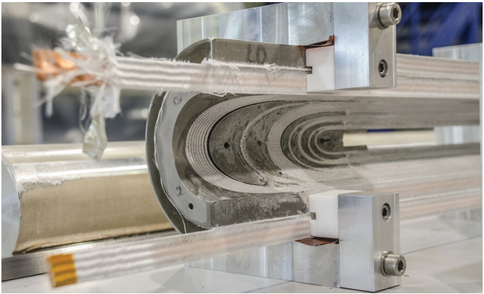
A niobium–tin coil for a testing an 11-T dipole-magnet model for the HL-LHC project. (CERN-GE-1310248 – 02)

technical design report was published in the spring. Numerous technical improvements were made to optimize the machine and its performance. Work on the AD extraction lines got underway with the replacement of the quadrupoles and the construction of equipment for ELENA began.