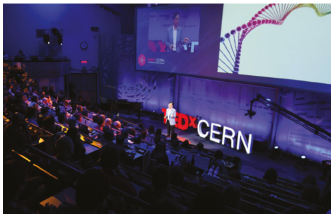
The fourth edition of TEDx CERN, which took place in November, explored how scientific curiosity and understanding spark innovation. (OPEN-PHO-LIFE-2017-005-2)