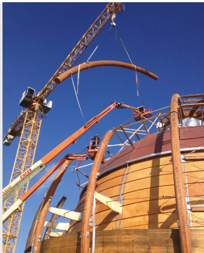
After 11 months of renovation work on the Globe of Science and Innovation, the Universe of Particles exhibition opened its doors again in April, and topped the TripAdvisor chart of tours and museums in the Geneva region. (BUL-PHO-VIEW-2015-002-7)

Visiting CERN has become a popular activity, even for busy world leaders: in 2016, the Laboratory welcomed five heads of state or government and organised 142 protocol visits. CERN is also highly attractive for the general public, including teachers and students, who discover how research in the world's largest laboratory for fundamental physics helps to answer the big questions about the universe. The annual number of visitors continues to increase, rising from 26 000 in 2006 to 120 000 in 2016. However, the demand for group visits is about three times higher, and "open tours" – guided tours for individual visitors – are usually fully booked within the first five minutes after registration opens. In addition, more than 70 000 people visited the two permanent exhibitions at CERN (Microcosm and the Universe of Particles).