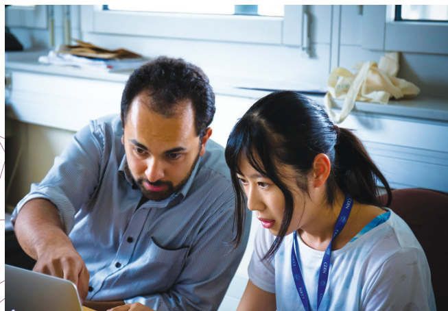
CERN’s training programmes provide opportunities to acquire early-career professional experience. Here, a summer student and her supervisor work on ATLAS physics research.

Several of these programmes were backed financially by the CERN & Society Foundation, whose aim is to “spread the CERN spirit of scientific curiosity for the benefit of society”. In 2017, the Foundation focused on the support of teacher and student activities: 90 schoolteachers received partial support for their participation in the National Teacher Programmes and 39 summer students from non-Member States were granted a full scholarship. The Foundation also fully financed the Beamline for Schools competition.