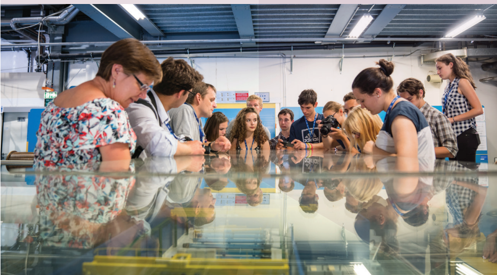
The High-School Students Internship Programme (HSSIP) was launched in May 2017 with the arrival of 22 Hungarian students, aged between 16 and 19, seen here during their visit to CERN's magnet testing facility.

CERN'S TEACHER PROGRAMMES HELP TO FOSTER A LOVE OF SCIENCE IN FUTURE GENERATIONS OF STUDENTS.