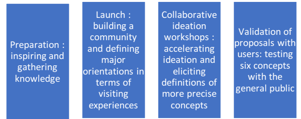
Fig. 1. The four steps of reinventing a museum

To investigate how experimenting with collaborative processes can contribute to reinventing an organization's purpose and practices, we conducted 12 semi-structured interviews with employees and management of the Insectarium as well as external participants, after the collaborative process was completed. We asked questions regarding the way the interviewees experienced the project, regarding the way the museum functioned prior to the project and regarding current practices within the museum. Each interview lasted between 60-90 minutes. Appendix A outlines key themes and questions addressed in the interviews. To complement the interview data and to further inform our analysis, we also had access to the multi-media archives of this 2-year process, documenting the different steps taken, as well as all the power-point presentations that the head of the museum made in order to present the project and how she saw her role in it.