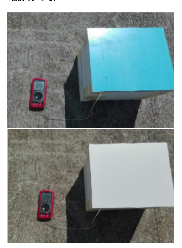
Fig.1 The experiment carried out at CERN Idea Square.

The prototype was positioned under the sunlight, firstly with the light blue roof. The initial temperature inside the prototype ( T_0 ) was measured and equal to the ambient temperature of 33°C. After a thermal transient of 20 minutes, the final temperature ( T_F ) has reached the value of 40°C.