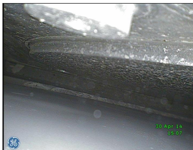
Figure 2. Initial signs of corrosion at the target neutron window

Target #2 is the result of a major upgrade of the original n_TOF target #1 following issues related to damage, oxidation and the migration of spallation products into the cooling water system. However, installed in 2007 and with a projected lifetime of approximately 10 years, the present n_TOF neutron spallation target is already showing initial signs of surface corrosion. The monolithic Pb block along with its cooling system cannot be repaired due to both its design and expected dose rate after removal and will therefore have to be replaced during the LS2 period to ensure reliable physics after LS2. It is worth noting that a target change at n-TOF is a lengthy process and would jeopardize the physics program for at least 1 year if done in during the physic's period.